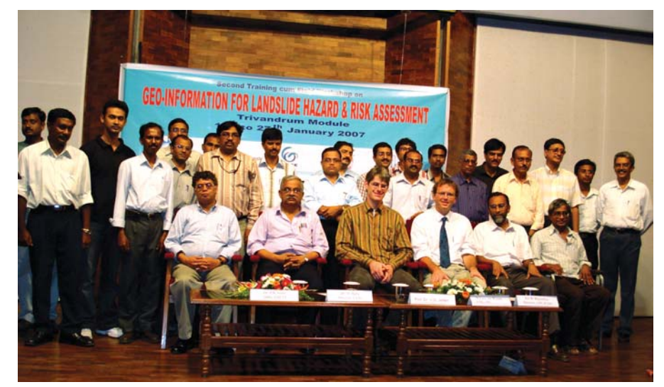
Participants of the Training cum Field Workshop at CESS Trivandrum